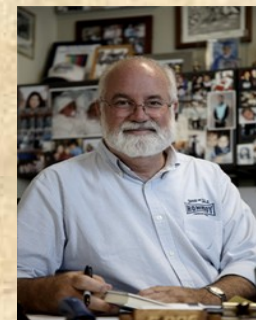
Father Gregory Boyle